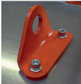
Centralized and balanced lifting eye.