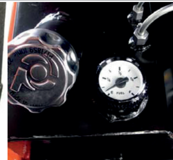
Fuel level gauge.