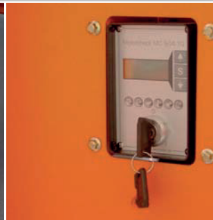
Electronically controlled engine.