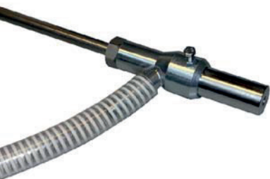
Wet Sand Blasting Equipment.