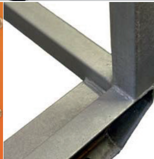
Hot Dip galvanized frame.