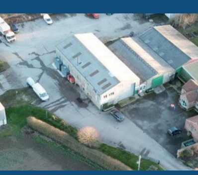
Hydroblast based in Yorkshire England