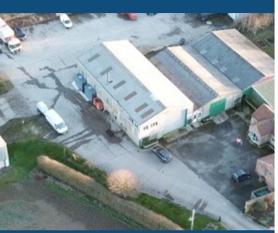
Hydroblast based in Yorkshire England