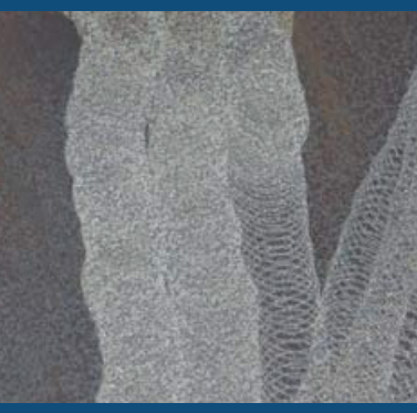
Water Blasting With Rotating Sapphire Jets