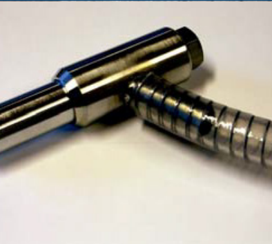
Sand Blasting Equipment