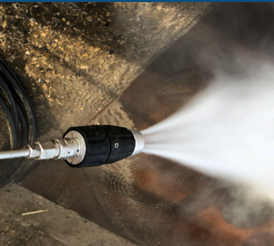
Ultra-Impact Nozzle 3000