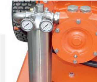
Stainless steel pump-head. Integrated cooling for plunger-seals.