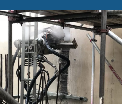
Aqua Spine Robot