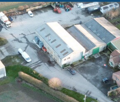
Hydroblast based in Yorkshire England