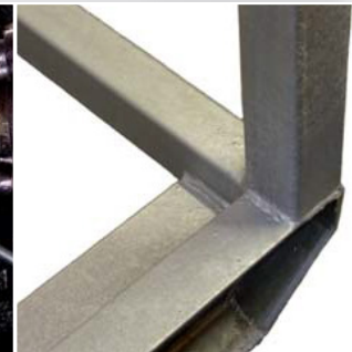
Hot Dip Galvanized Frame