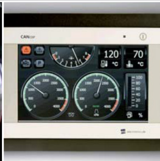
Electronic Engine Controller