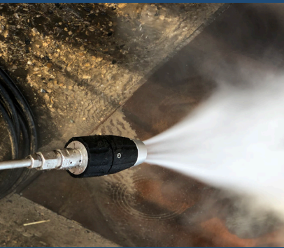
Ultra-Impact Nozzle 3000