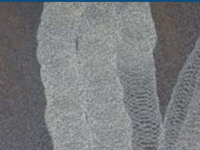
Water Blasting With Rotating Nozzles