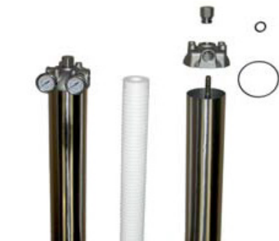
Strainers & Filtration