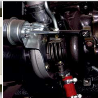
4 Cyl. Turbo Diesel Engine