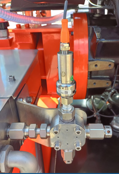
High pressure sensor