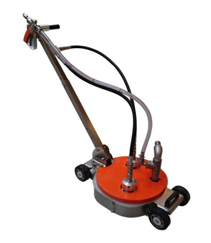
Double Deck Cleaner 15 - 40kpsi