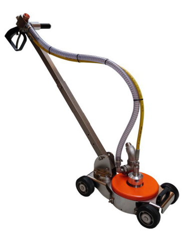
Deck Cleaner 15 - 40kpsi