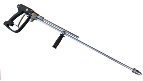
Dump Gun 40kpsi