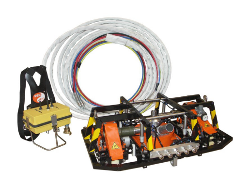
Crawler Magnetic - Pneumatic