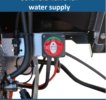
Main battery switch