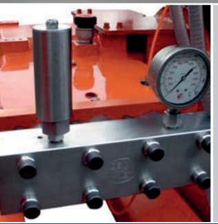
Stainless steel pump-head