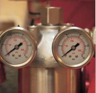
Filter Change Indicators