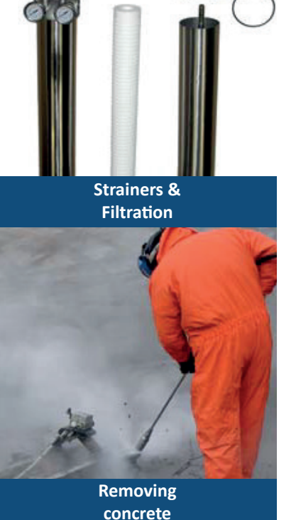
Hydroblast based in Yorkshire England