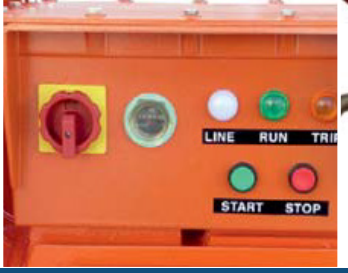
Die cast electrical box with main switch, overload relay & hour meter.