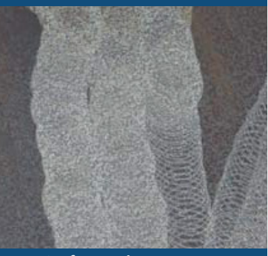
Surface - Ultra Impact Nozzle