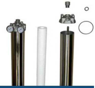
Strainers & Filtration