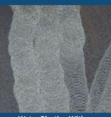
Water Blasting With Rotating Nozzles